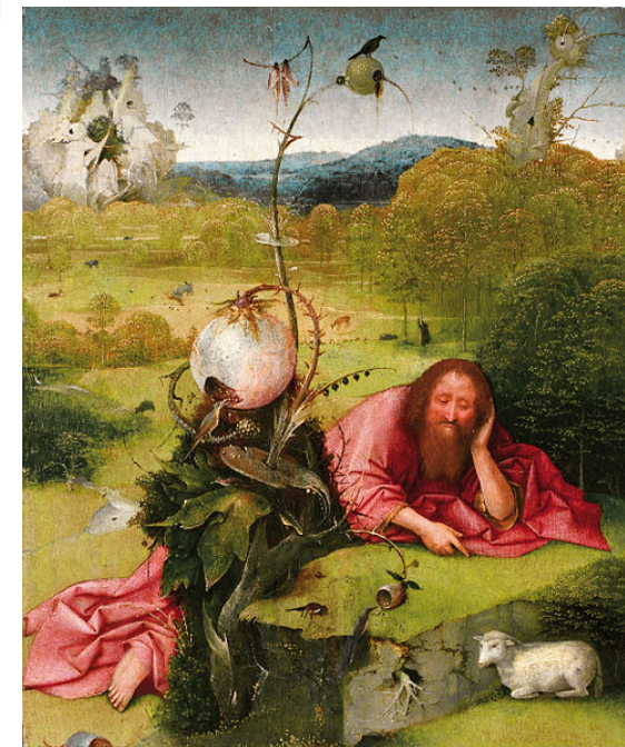
St John in the wilderness – Hieronymus Bosch 1489